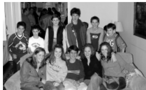
slideshow tour 2002 - D.C.

Anyone interested in purchasing a summer 2001 picture CD, who missed the deadline on the Bunk1 website can contact our office or send us a check for $20 and we'll send you a CD.